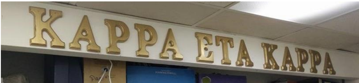
letters taken from the previous house sign, painted gold, and hung in the computer room

We are also pursuing house improvements at a recently unprecedented rate. Strong efforts are being made to make the house more aesthetically pleasing and comfortable. We have hung old signs and letters around the house.