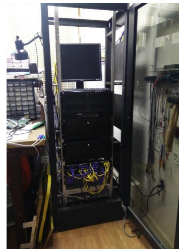
server rack w/ public server, private server, routing server, gigabit switch, patch panel, and battery

We are also making strides in a big network overhaul with the introduction of a new server to our server rack which is to be used to host a variety of web services both utilized and created by the membership. The foremost use of this machine will be hosting our delta.khk.org website, but we also have created several services such as a library search engine, an alumni search Base, an online agenda system, a slideshow and upload system, Gitlab server, as well as a document access solution for our in house data server. We have also recently finished upgrading to an entirely cat6 gigabit network.