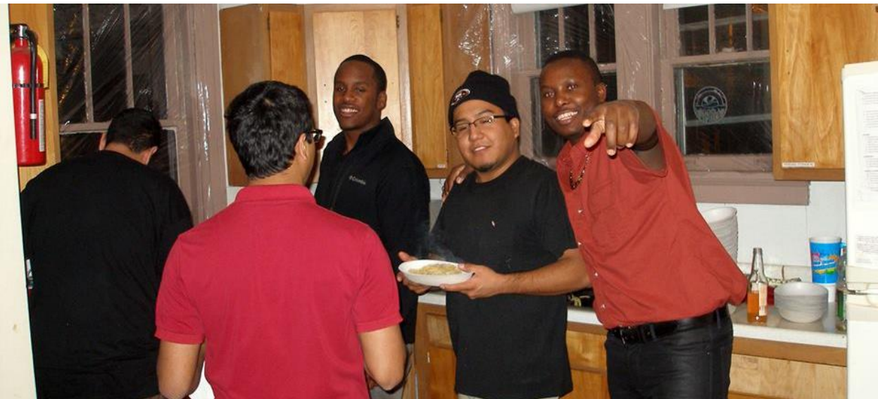
Iota Pledges, 2015

The initiation would be compared to being thrown into a lion pit with nothing but a few resources and us, the brothers. We fought emotions, temptations, and worse of all each other. And out of the ashes, a phoenix rose. The omicron II class finally graduated into brotherhood. KHK IOTA will no longer be an urban legend, but a definition of what determination, attitude, and effort will take us.